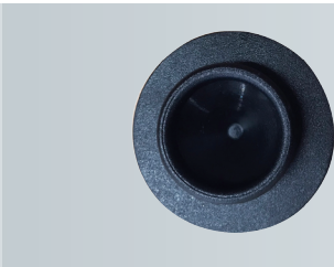
Pop-Off Cup Head