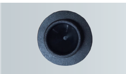
Pop-Off Cup Head